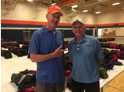
Thank you, Loveland Sertoma! your delivery services ensured schools had backpacks on time for student requests.